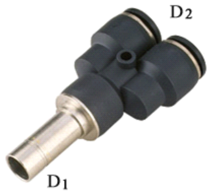
Plug-in Reducer Y