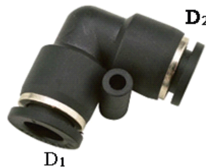
Union Elbow Reducer