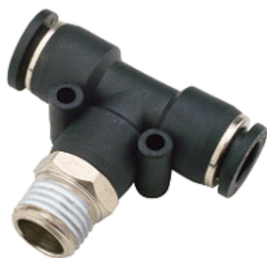
Male Branch Tee