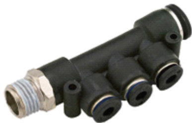
Male Triple Branch