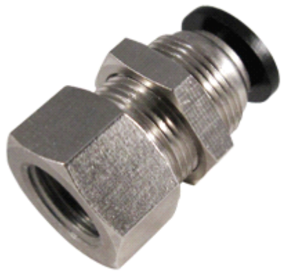
Bulkhead Female Straight