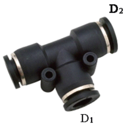
Union Elbow Reducer