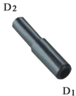
Reducer Tube Splicer