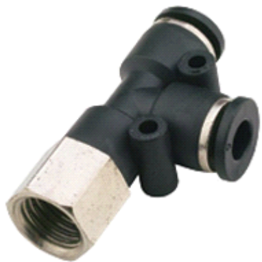
Female Run Tee