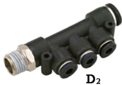
Male Re-Triple Branch