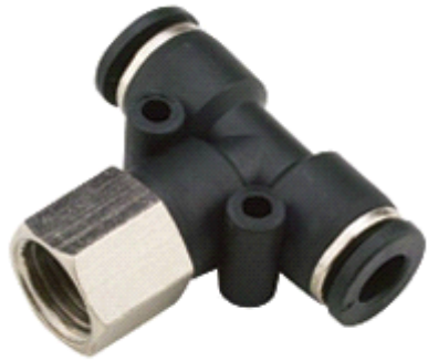
Female Branch Tee