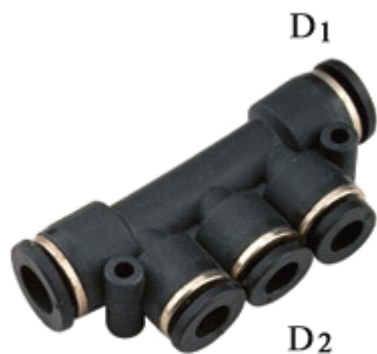
Triple Branch Union