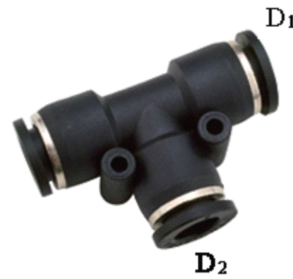
Union Elbow Reducer