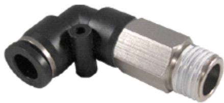
Extended Male Elbow