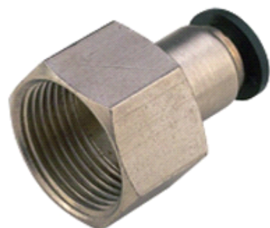
Bulkhead Union Elbow