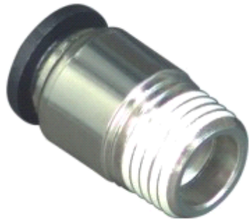
Hex. Male Straight