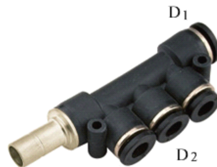
Plug-in Reducer Triple Branch