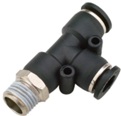
Male Run Tee